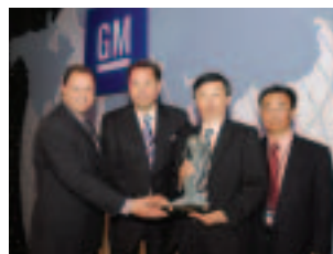
GM Supplier of the Year Award