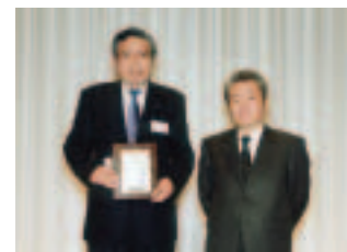
Komatsu Grand Partner Award