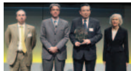
Renault: Best Worldwide Quality