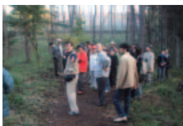
Nature observation outing