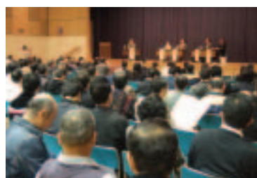
Symposium in progress