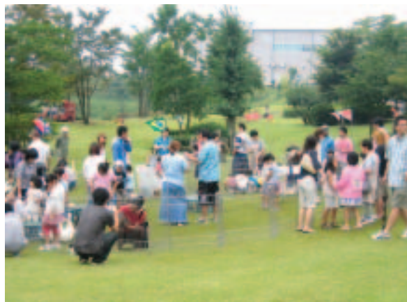
The Sanden Forest Community Festival

The Sanden Forest, which is located on the extensive grounds of Sanden's Akagi Plant, is regarded as a rare example of a model for symbiosis between nature and industry. With the idea of having members of the local community gain a better understanding of the Sanden Forest model, we held the first "Community Festival" in August 2007. With the support of other local companies, we were able to hold the festival with the participation of many members of the community.