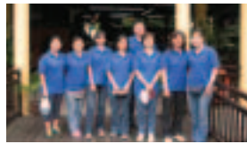
Environmental preservation activities