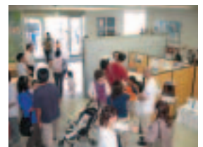
A portion of the Akagi Plant facilities were opened for viewing.