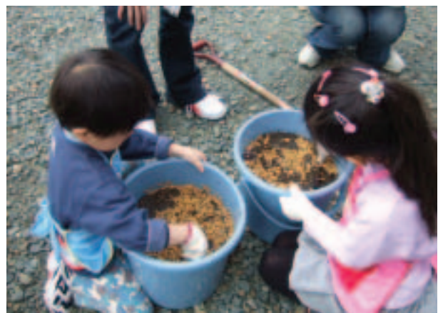
Planting rice seedlings in buckets