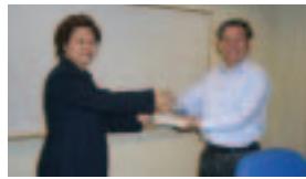
Donations to schools