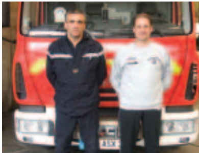
Gifts of uniforms for community fire department staff