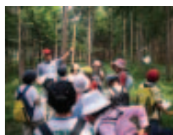
Participants enjoying a walk through the forest

Sanden established a non-profit organization called the Akagi Club to share the Sanden Forest, which is an integral part of the Akagi Plant, with as many people and educational institutions as possible. Now in its fourth year, the Akagi Club has instituted the "Forest Kids" activities as one of its annual programs. These are held five times a year from July through November and include woodworking, working with plant-based dyes, bird watching, and other activities to enable the participants to enjoy firsthand the experience of being in contact with nature.