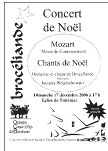
SME offers support for community concerts.