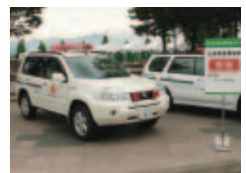
Blood donation collection vehicle donated to the Japan Red Cross

Sanden donated a collection vehicle for blood donation to the Japan Red Cross during the 42nd Nationwide Blood Donation Promotion Assembly, which was held in the Gunma Arena, the multifunctional sports center of Gunma Prefecture.