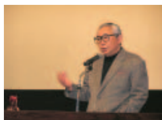
Cultural Symposium events

Sanden implements programs suited to the needs of each locality, with the aim of promoting social development through access to high-quality cultural activities. In the fall of each year, we hold a Cultural Symposium in Isezaki, Gunma Prefecture, that features an enjoyable talk by a prominent individual. In 2006, we invited So Kuramoto, the author of the well-known play "From the Northern Country," and he spoke on the theme of the natural environment of Hokkaido.