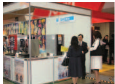
Hotel and Restaurant Show 2007