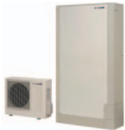
New EcoCute thin storage tank

ions and questions from those attending the preview, and, during the two days of the preview, we gained a renewed awareness of the market potential of the EcoCute water-heating systems and the high level of expectations regarding Sanden products among our customers.