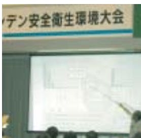
Photo 1 Convention on Health, Safety, and the Environment