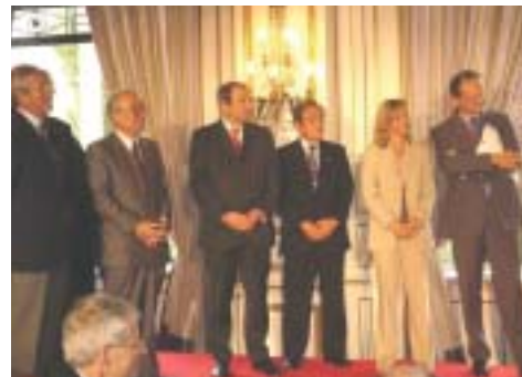
World Investment Conference