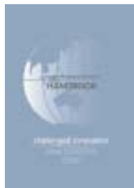
Sanden Philosophy Handbook

The Sanden Group is guided by "SW23," a set of philosophy, value, and action statements that define the fundamental guidelines for employees worldwide.