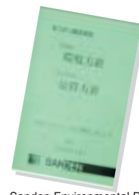
Sanden Environmental Policy All employees at ISO certified business sites receive a Sanden Environmental Policy Handbook , which is instrumental in raising employees' environmental consciousness.